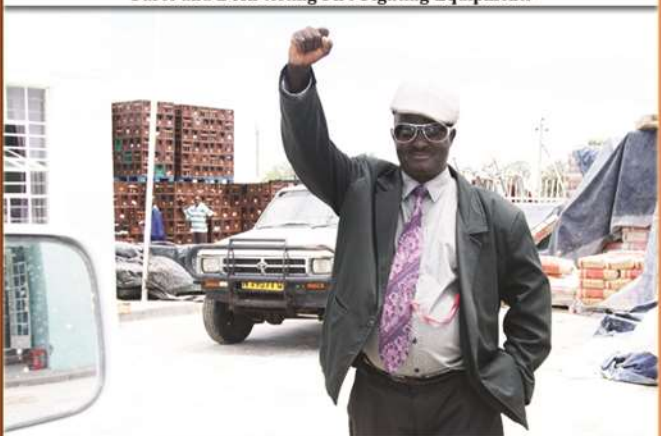
Omugoyi nOmugoyi showing some loyalty