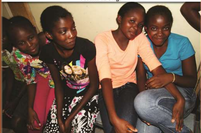
Girls at the movie launch