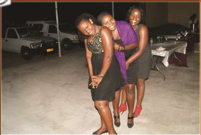
Ladies Looking Good